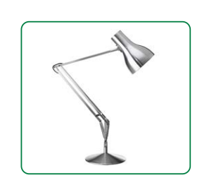
Used Office Decor & Lighting